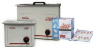
Clean&Simple™ Ultrasonic Cleaners and Tablets

Documents: date, time, temperature, pressure.