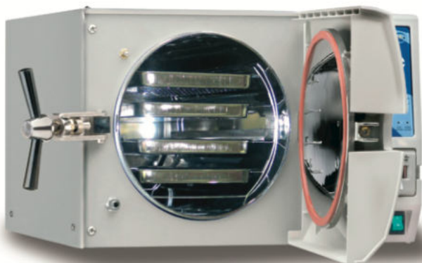
EZ10 with 4 large trays