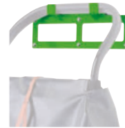
Wall mount 6254-050-000