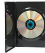
In-service video 6253-001-167