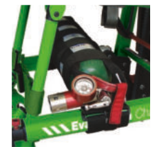
O2 holder 6250-140-000