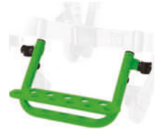
Foot support 6254-029-000