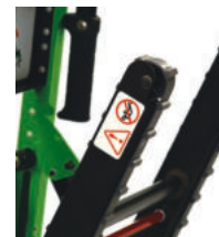
Aggressive Stair-TREAD track 6253-070-000