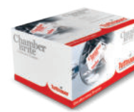
Chamber Brite Autoclave Cleaner