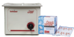
Clean & Simple™ Ultrasonic Cleaners and Tablets

Documents: date, time, temperature, pressure.