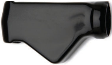
Reusable Ambient Light Shield 11171-000054 (5/pack)