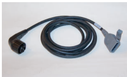
QUIK-COMBO Therapy Cable 11110-000004