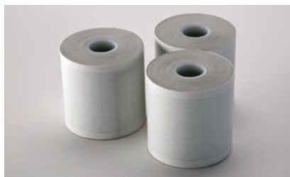
50mm x 22mm ECG Printer Paper 11240-000031 (3 rolls/box)