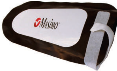
Disposable Ambient Light Shield 11171-000055 (10/pack)