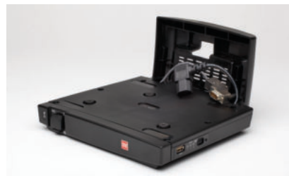
CodeManagement Module for use with LIFEPAK 20e Defibrillator/Monitor - Wireless Connects to the LIFEPAK 20e defibrillator to add wireless connectivity. 11150-000018