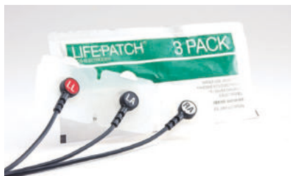
LIFE-PATCH® ECG Electrodes Adult, pregelled. 11100-000001 (3/pack) 11100-000002 (4/pack)