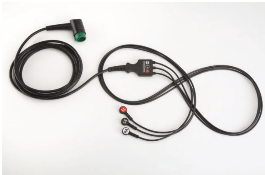
3-Wire ECG Cable 11110-000029