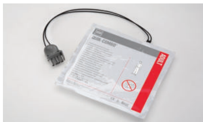
EDGE System Electrodes with QUIK-COMBO Connector and REDI-PAK® Preconnect System 11996-000017 (42" leadwire length)