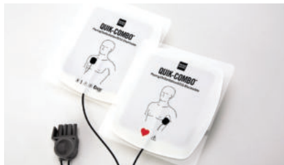
EDGE System Electrodes with QUIK-COMBO Connector 11996-000091 (24" leadwire length)

18 month minimum shelf life unless specified