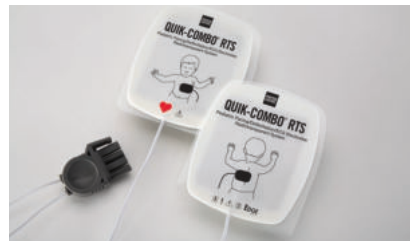
Pediatric EDGE System RTS Electrodes with QUIK-COMBO Connector

For use only with manual monitor/defibrillators; 12 month minimum shelf life at time of shipment.