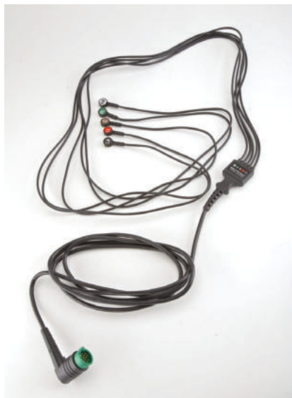
5-Wire ECG Cable 11110-000066