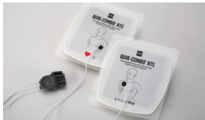
EDGE System RTS (Radiotransparent) Electrodes with QUIK-COMBO Connector 11996-000090 (24" leadwire length)