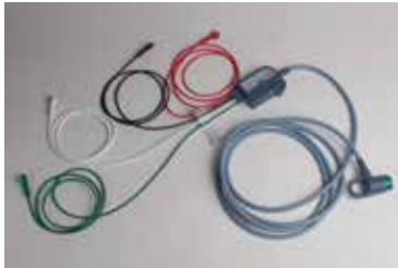
12-Lead ECG Cable Trunk Cable with 4-Wire Limb Leads

11111-000018 (5ft AHA) 11111-000019 (5ft IEC) 11111-000020 (8ft AHA) 11111-000021 (8ft IEC)