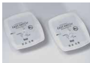
EDGE System Electrodes with FAST-PATCH Connector Must be used with QUIK-COMBO to FAST-PATCH Adapter Cable (11110-000052) 11996-000092