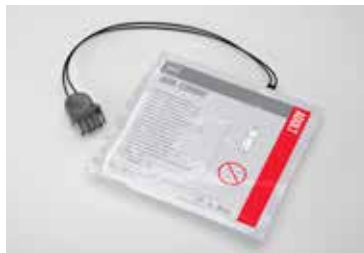
EDGE System Electrodes with QUIK-COMBO Connector and REDI-PAK ™ Preconnect System 11996-000017 (42" leadwire length)