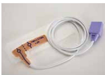
Oxisensor II (24/box) Infant 11996-000115 (18 in) Neonatal/Adult 11996-000117 (18 in)