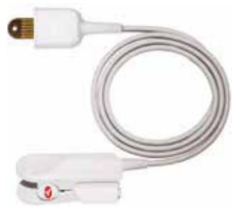
LNOP Reusable Sensor