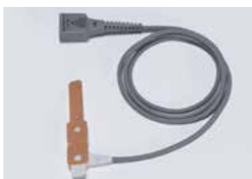
Oxiband Reusable Sensor Includes 50 disposable adhesive sensors 11996-000061 (Ad/Neo) 11996-000062 (Ped/Inf)