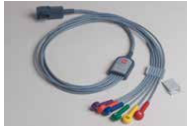
12-Lead ECG Cable 6-Wire Precordial Attachment

11111-000018 (5ft AHA) 11111-000019 (5ft IEC) 11111-000020 (8ft AHA) 11111-000021 (8ft IEC)