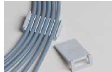
4-wire Cable Comb 21300-008054 (10/pk)