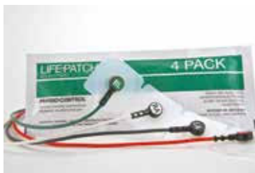
LIFE-PATCH ECG Electrodes

Adult (Available in the European Union.) 1700-003 (3/pk)