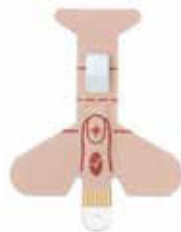
LNOP Adhesive Sensor (20/box)