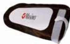
Disposable Ambient Light Shield