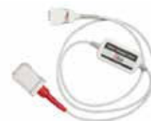
MNC-1 Adapter Cable

Allows LIFEPAK 12 defibrillator/monitor with Masimo SpO 2 to connect to Nellcor sensors.