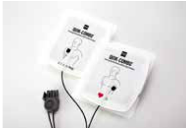
EDGE System Electrodes with QUIK-COMBO Connector 11996-000091 (24" leadwire length)

18 month minimum shelf life unless specified