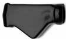
Reusable Ambient Light Shield