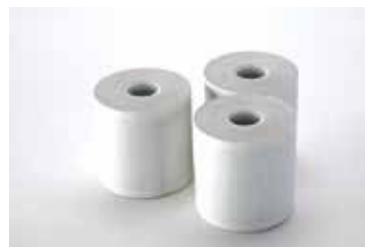
Strip Chart Recorder Paper

Adult, pregelled. (Not available in the European Union.) 11100-000002 (4/pk) 11100-000001 (3/pk)