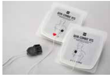
EDGE System RTS (Radiotransparent) Electrodes with QUIK-COMBO Connector 11996-000090 (24" leadwire length)