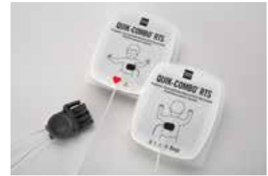
Pediatric EDGE System RTS Electrodes with QUIK-COMBO Connector For use only with manual monitor/defibrillators; 12 month minimum shelf life at time of shipment. 11996-000093 (24" leadwire length)