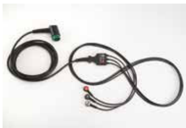
3-Wire ECG Cable

Right-angle connector 11110-000029 (AHA) 11110-000030 (IEC)