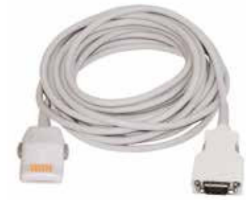
LNOP Patient Cable