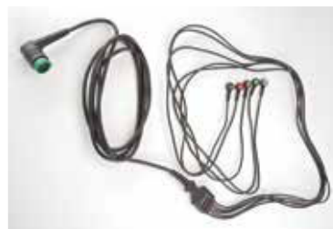
5-Wire ECG Cable

Right-angle connector 11110-000029 (AHA) 11110-000030 (IEC)