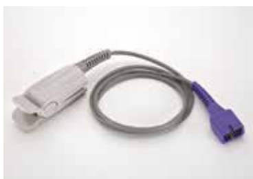
DURASENSOR Reusable Clip 11996-000060 (Ad)