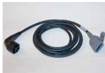
QUIK-COMBO Therapy Cable For use with the LIFEPAK 12 defibrillator/monitor. 11113-000040