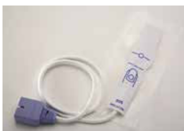
Oxisensor II (24/box) Adult 11996-000113 (18 in) 11996-000114 (36 in) Pediatric 11996-000116 (18 in)