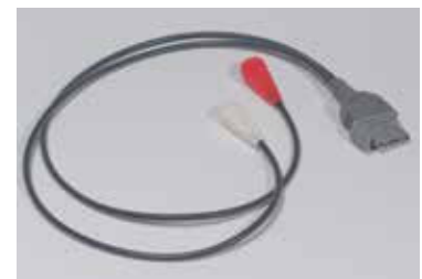
FAST-PATCH ® Adapter Cable For use with the QUIK-COMBO therapy cable for the LIFEPAK 12 defibrillator/monitor. 11110-000052