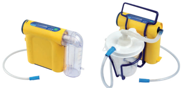
880061xx LCSU 4 (300 ML) 880062xx LCSU 4 RTCA (300 ML)